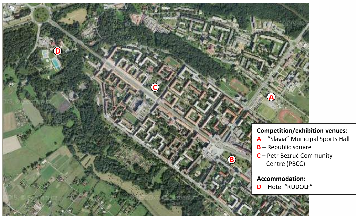
Fig. 1 – Detailed plan of Havirov, placement of different competition venues, more information at interactive map also ( http://www.europacup2011.cz/en/competition-venue/interactive-map/ )

The competition EUROPA CUP 2011 takes place at three venues. During the competition time 3 tasks will be made (on Friday 2 nd of September 2011) inside the main working / exhibition area of the “SLAVIA” Municipal Sports Hall , 1 task (on Saturday 3 rd of September 2011) outside at the Republic square and 2 tasks (on Saturday 3 rd of September 2011) on the stage during the final gala-evening ceremony at the Petr Bezruč Community Centre in front of audience. All working / exhibition places will be marked with a number and the name tag of the relevant competitor. Competitors will draw their numbers on Wednesday 31 st of August 2011.