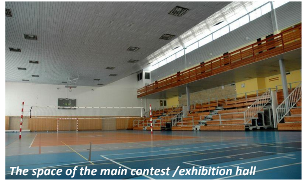
The space of the main contest / exhibition hall