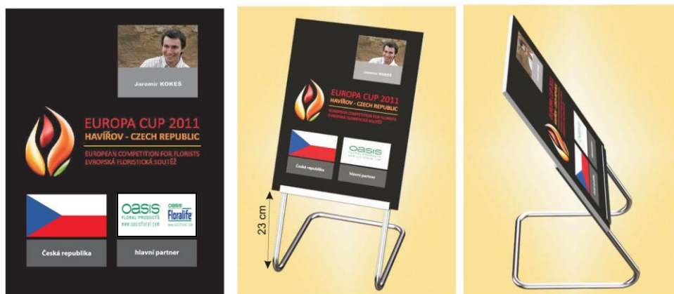
Fig. 3 – Name plate for the competition / exhibition site at the small side hall of “SLAVIA” MSH