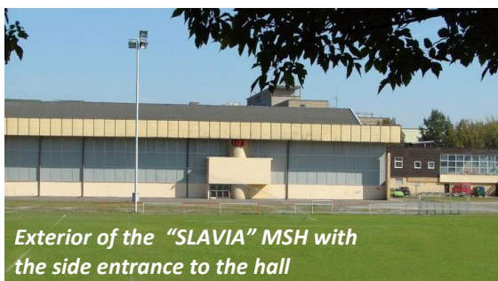
Exterior of the "SLAVIA" MSH with the side entrance to the hall