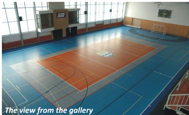
The view from the gallery