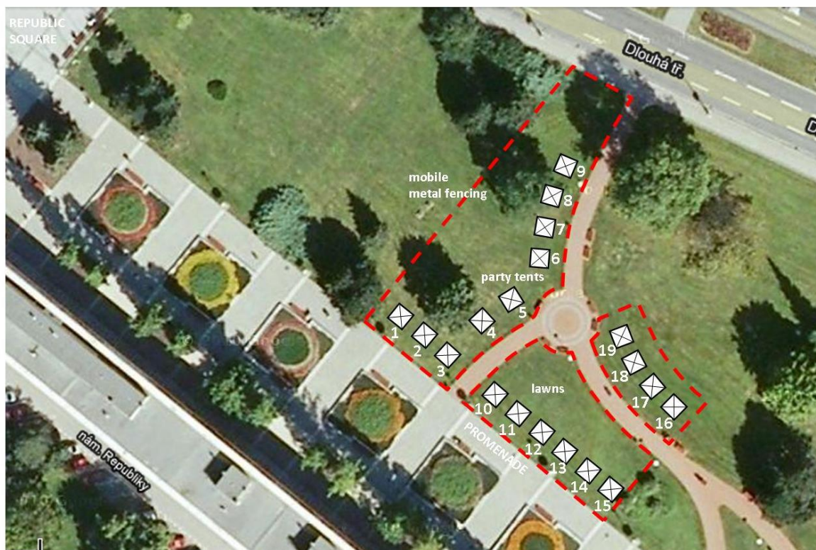
Fig. 4 – The layout of competition place at the Republic square